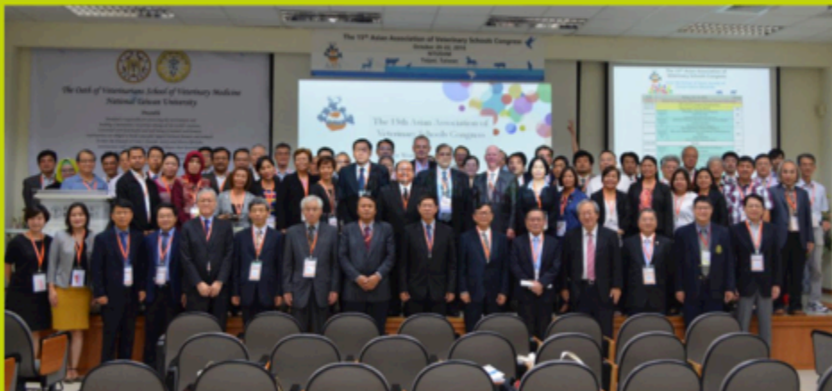
15th Asian Association of Veterinary Schools Congress

October 20-21, 2016 at National Taiwan University, Taipei, Taiwan R.O.C