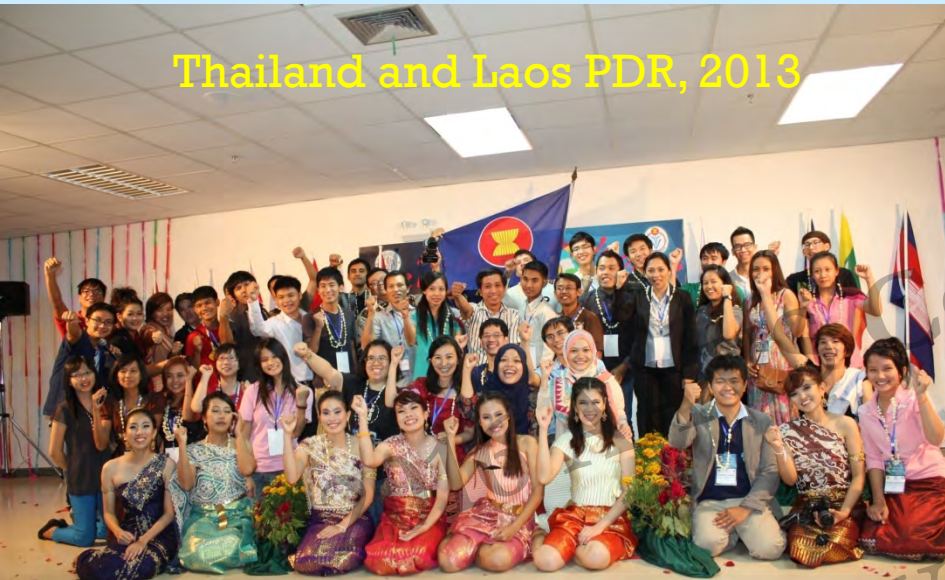
Thailand and Laos PDR, 2013