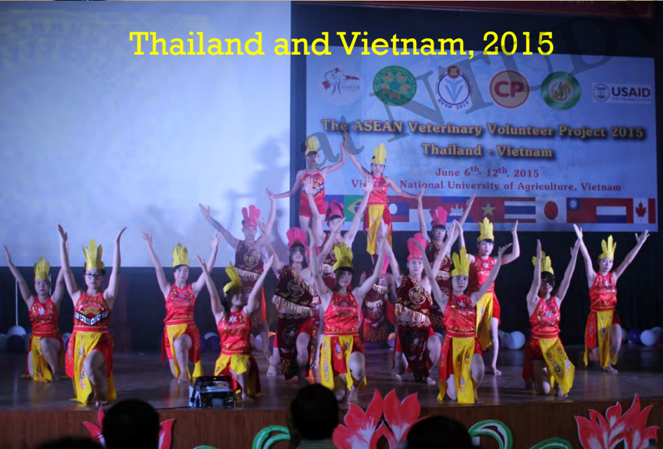
Thailand and Vietnam, 2015