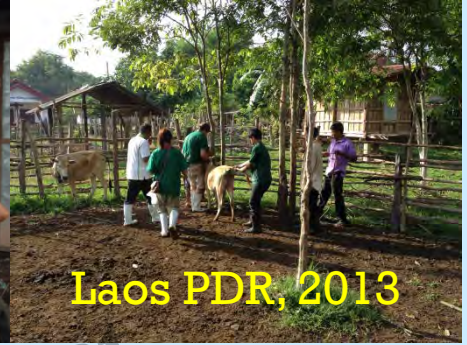
Laos PDR, 2013