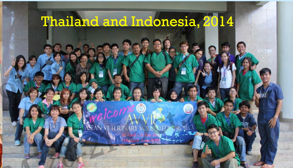
Thailand and Indonesia, 2014